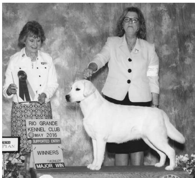
Marzi, BOSS Ch. Sher-Mi 3C Marzipan finishing at 10 months of age, above, BOSS below