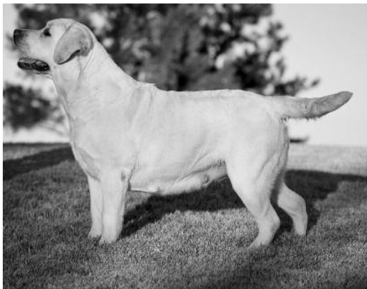
Pink, Ch. Sher-Mi Secret

times with two different studs to breed Rox. She wasn't having it. Third go, she was bred to Noah with success. We have our darling Paige from this breeding. Sher-Mi 3C Front Paige News, RN. Paige didn't quite make height size for the conformation ring so my partner's daughter is having fun putting obedience titles on her. They are currently working towards a CD title.