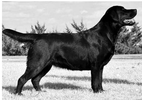
Rox, Sher-Mi 3C Heart Of Rock N Roll