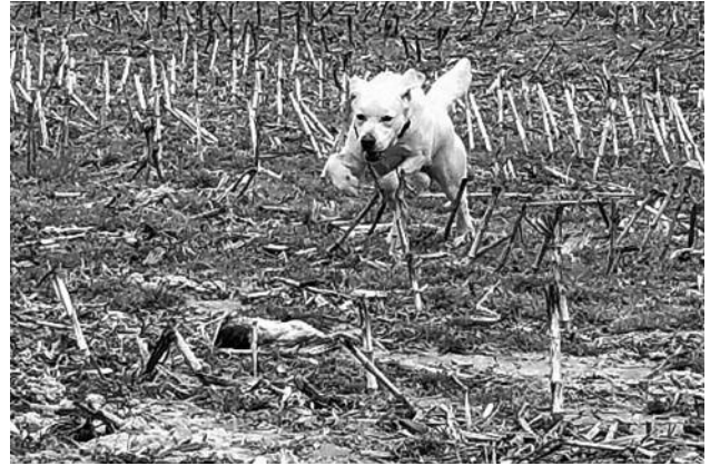
Luca, Ch. Sher-Mi 3C Bringer Of Light, JH